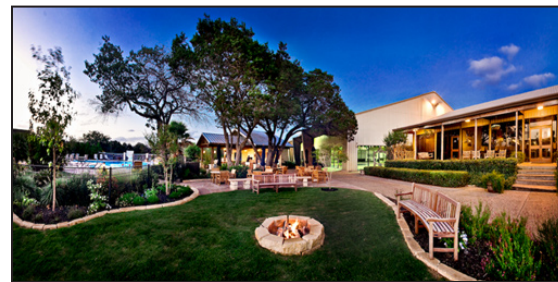
T-BAR- M RESORT