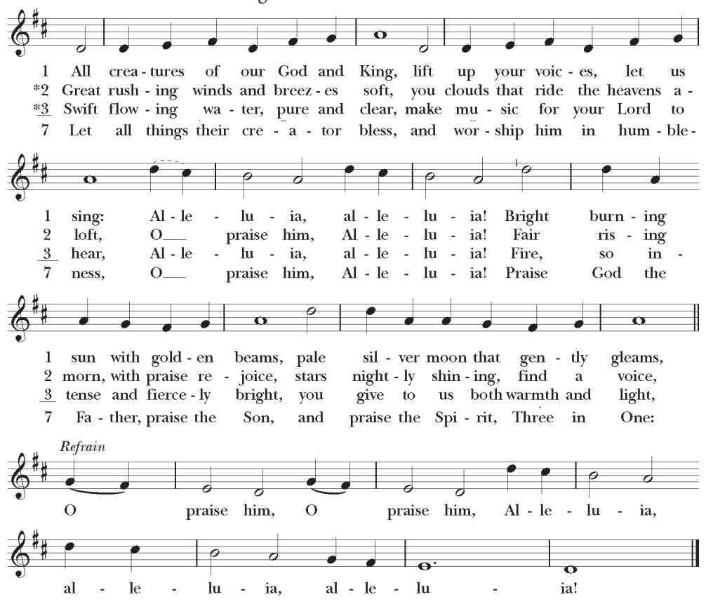
The refrain may be sung antiphonally, by phrase; all join in the final Alleluia.

HYMN 400 'All Creatures of our God and king'