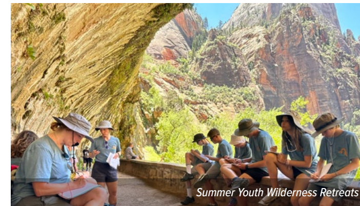
Summer Youth Wilderness Retreats