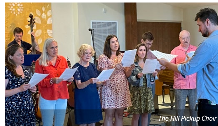
The Hill Pickup Choir