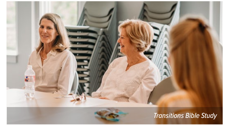
Transitions Bible Study