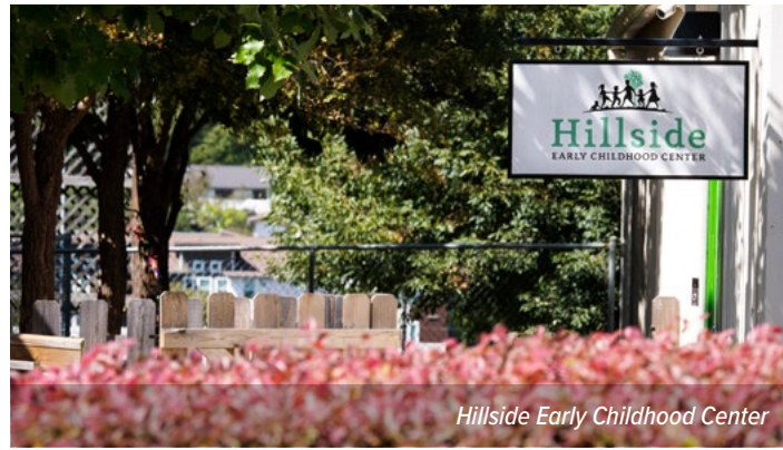
Hillside Early Childhood Center