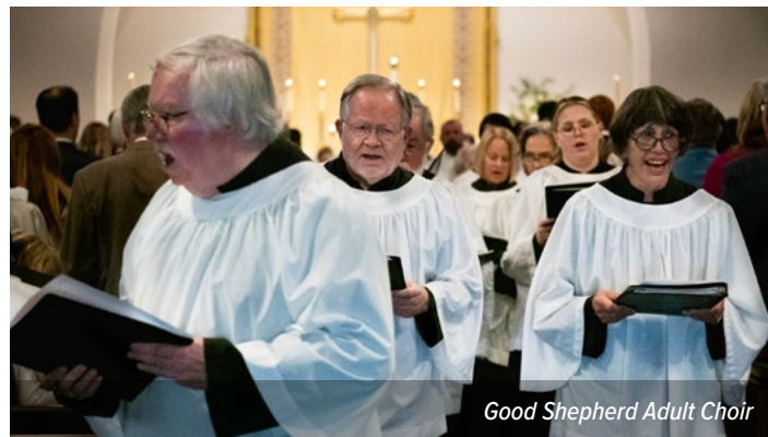
Good Shepherd Adult Choir