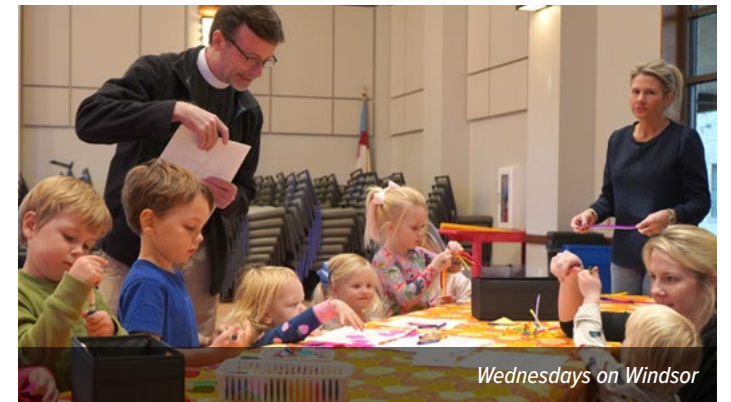
Wednesdays on Windsor