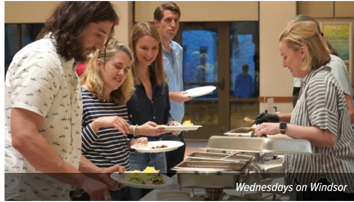
Wednesdays on Windsor