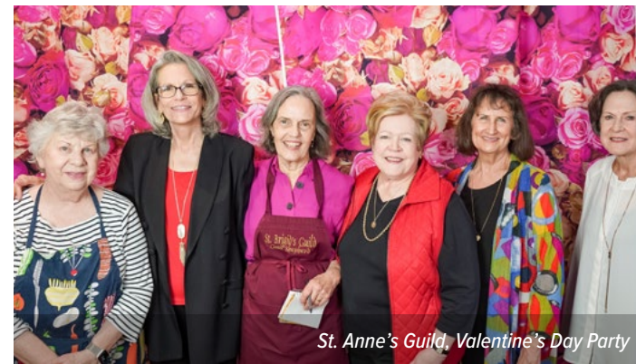
St. Anne's Guild, Valentine's Day Party