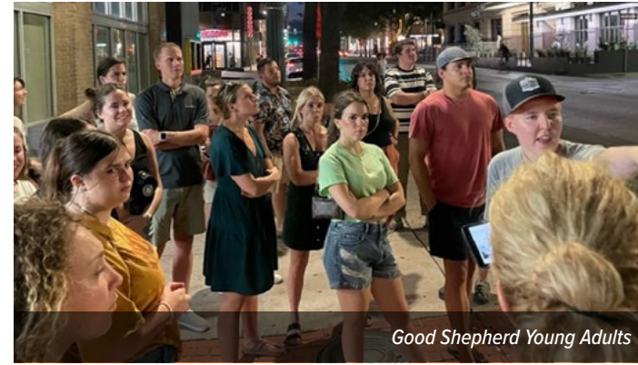
Good Shepherd Young Adults