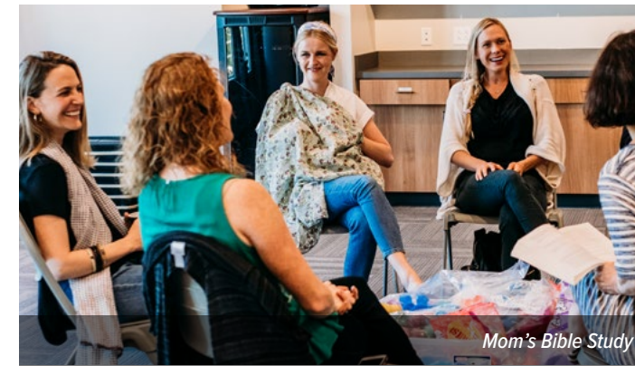
Mom's Bible Study