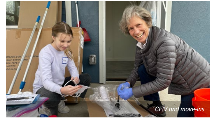
CFIV and move-ins