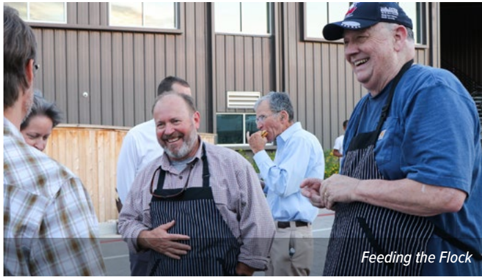
Feeding the Flock