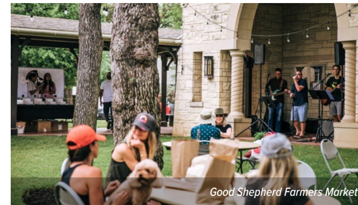
Good Shepherd Farmers Market