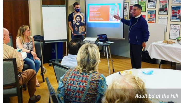
Adult Ed at the Hill