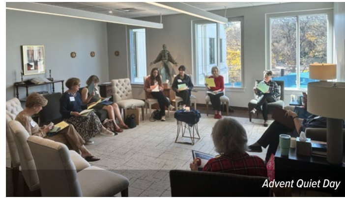
Advent Quiet Day