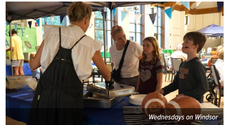
Wednesdays on Windsor