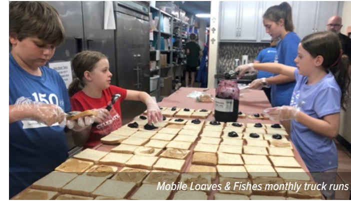
Mobile Loaves & Fishes monthly truck runs