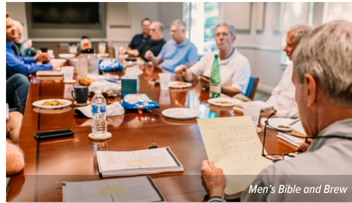
Men's Bible and Brew