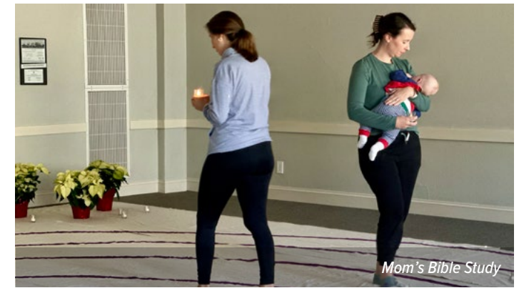
Mom's Bible Study