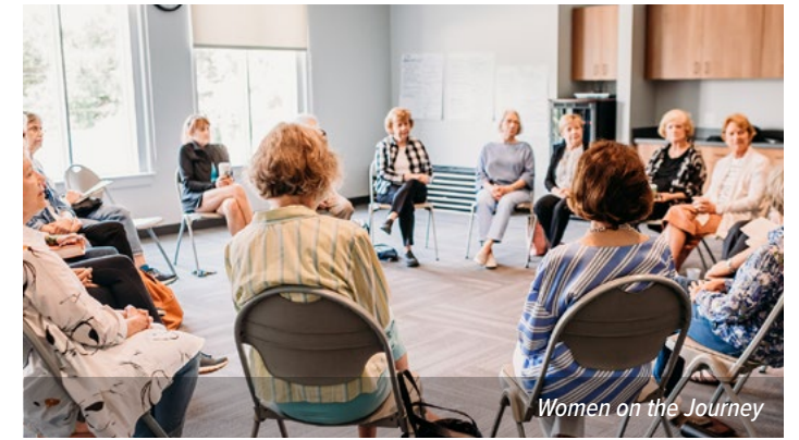
Women on the Journey