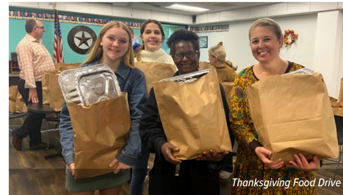
Thanksgiving Food Drive