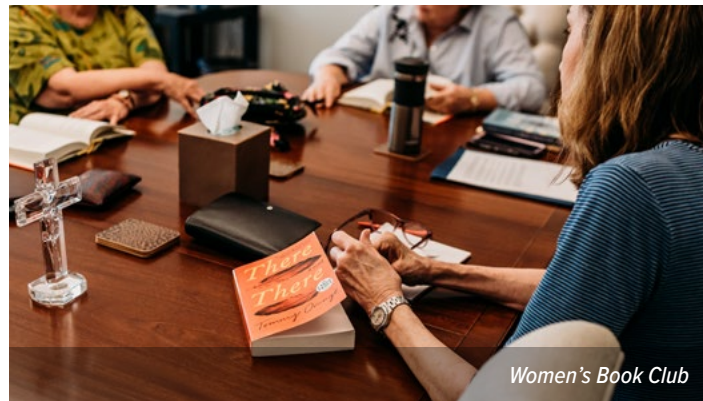
Women's Book Club