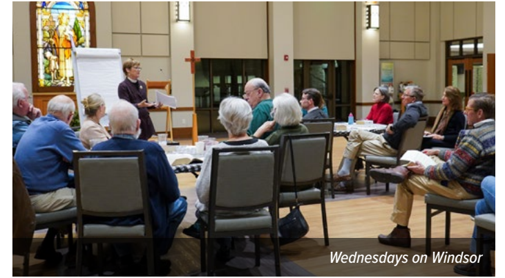
Wednesdays on Windsor