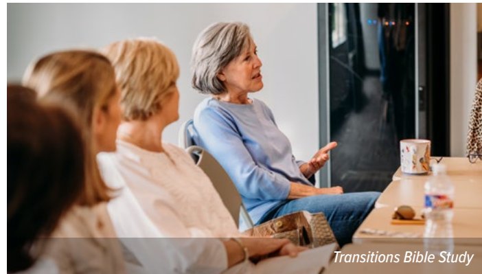
Transitions Bible Study