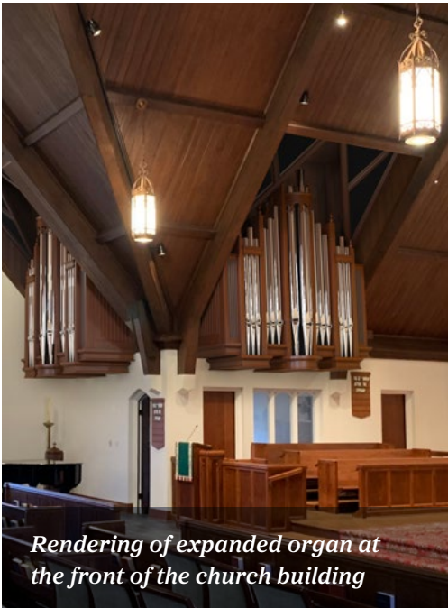
Rendering of expanded organ at the front of the church building

During the renovation project, the parish engaged Orgues Letourneau of Quebec, Canada to design and build a new organ for the church building on the Windsor campus. Letourneau’s design called for pipes at the front and rear of the church to allow for balanced sound across the nave and to support congregational signing and a range of liturgical music. The parish installed the pipes at the rear of the nave during 2016, and in 2023 the parish engaged Letourneau to complete the organ by installing pipes in the front of the building. The pipes in the front will complete the instrument as it was originally designed by Letourneau and originally envisioned by the parish’s organ committee. Completing the instrument will allow the choir to easily hear the organ music without the sound being too loud in the back of the room. The parish has secured a place in Letourneau’s production schedule, and the instrument is scheduled to be installed in 2026.